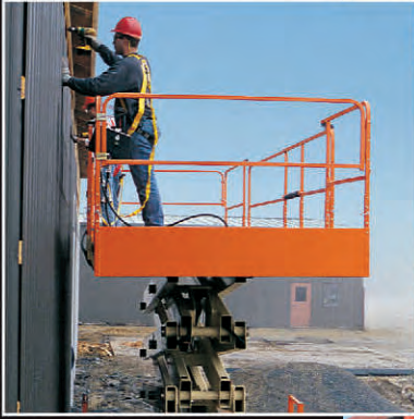
MegaDeck™ Optional Deck Extension Improves Operator Reach for Greater Productivity