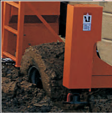
Unmatched Rough Terrain Performance