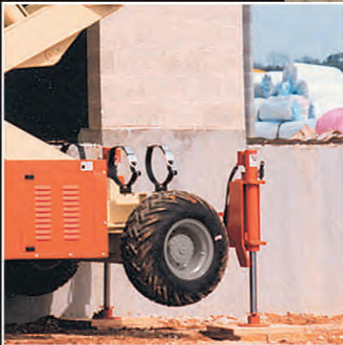
Independently Controlled Leveling Jacks for Enhanced Performance