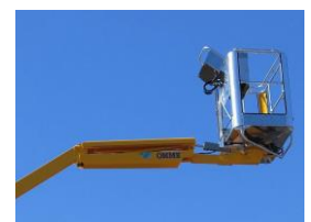
Fly jib (option)