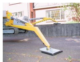
Easy set up